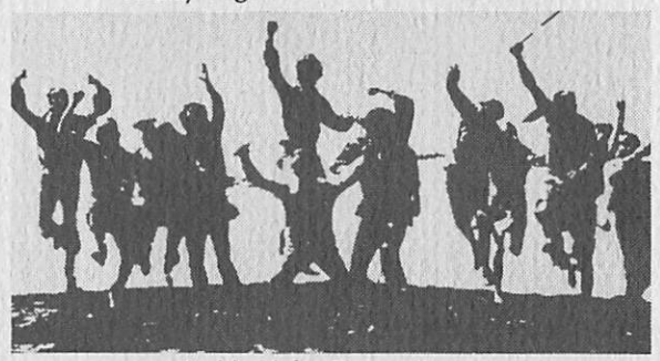
Humboldt Light Opera Company.