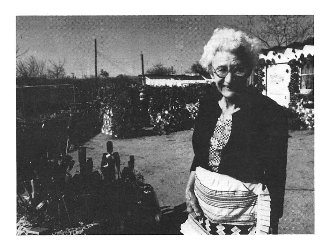
MICHELLE VIGNES "Grandma Prisbrey in her Bottle Village," 1977 Cibachrome print

THE CHEVRON GALLERY, 555 MARKET STREET, SAN FRANCISCO, APRIL 9 THROUGH MAY 25, 1984