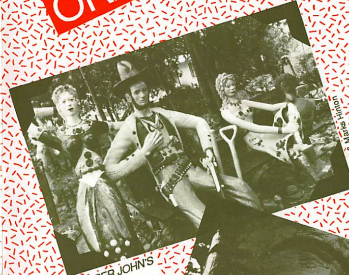
TRAPPER JOHN'S LODGE