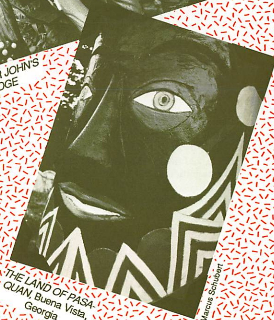
THE LAND OF PASA- QUAN, Buena Vista, Georgia