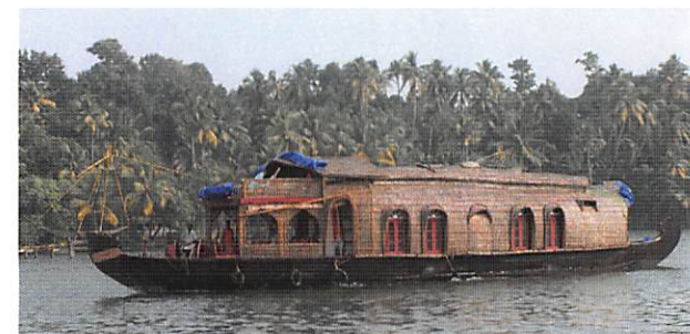
Kerala, backwater boat

An extraordinary adventure to both North and South India to see Nek Chand's two Rock Gardens, and the Taj Mahal, Chandigarh, Kerala, and much more on this 16 day journey.