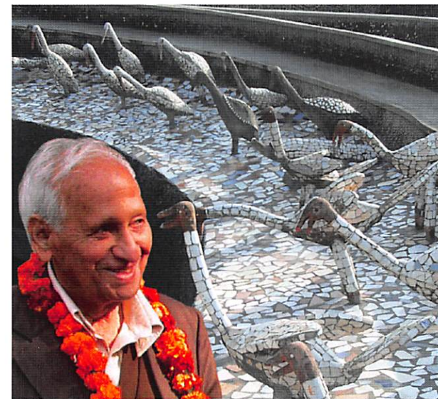
Nek Chand Saini, creator of Rock Garden