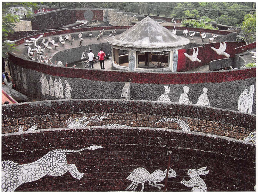
Palakkad, Kerala, India