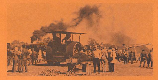
Threshing with steam engines at Horse Farming Days.