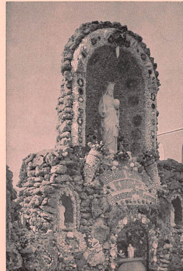
Shrine of Christ the King

Ten miles from Dubuque, Iowa on the Great River Road