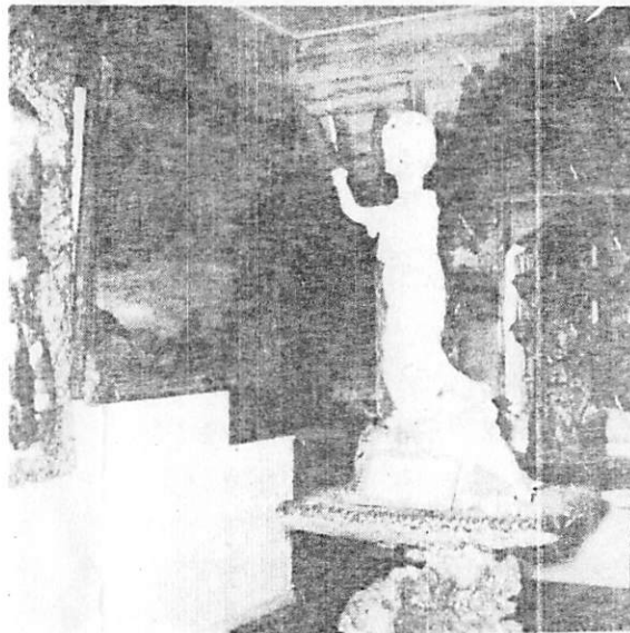
"QUEEN OF THE ROCKS"

At the base is a rock from every state in the Union.