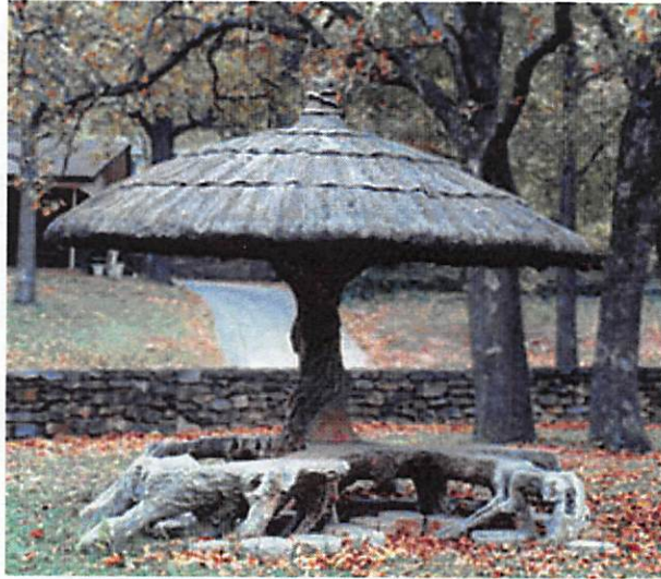
Rodriguez sculpture resembling a "thatched" palapa shelter with tree-shaped benches, Lakewood Park, North Little Rock.

Described during his lifetime as a "naturalistic artist," Dionicio Rodriguez was a Mexican-American sculptor whose outdoor works in tinted reinforced concrete clearly imitate forms found in nature, most frequently, though not exclusively, trees and stone masses. His sculptures also depict fallen or decaying trees that function as footbridges, shelters, and benches. Typically his works were commissioned for landscape settings such as parks, gardens and cemeteries. Concrete sculpted to imitate wood is called "rustico" or "el trabajo rustico" (rustic work) in Mexico. So convincing are Rodriguez's imitations of nature that observers unfamiliar with his work frequently mistake it for real or petrified wood. Rodriguez' sculptures are known to exist in seven states, with Arkansas possessing one of the finest and most representative collections.