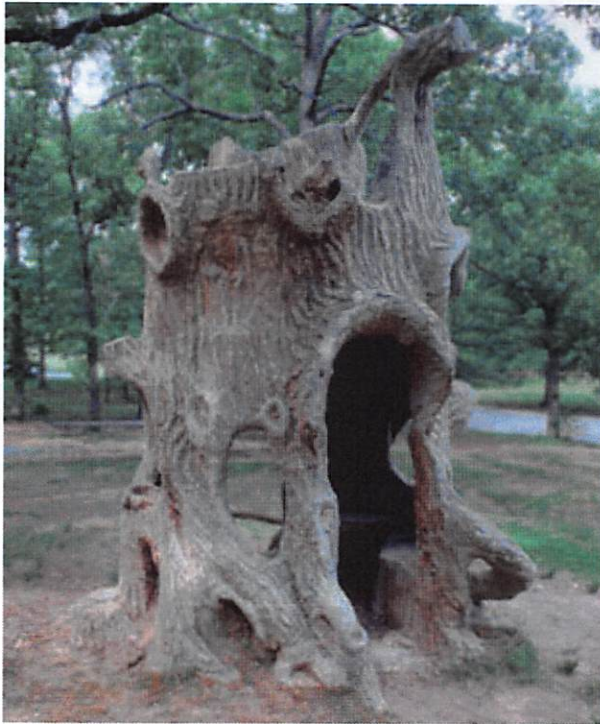
Hollow tree trunk shelter in Lakewood Park, North Little Rock.