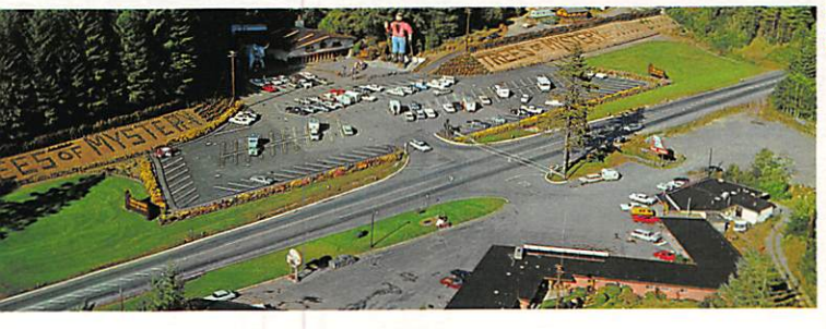
Modern-Motel Trees, Blue Ox Coffee Shop, and the "End of the Trail" Bar.