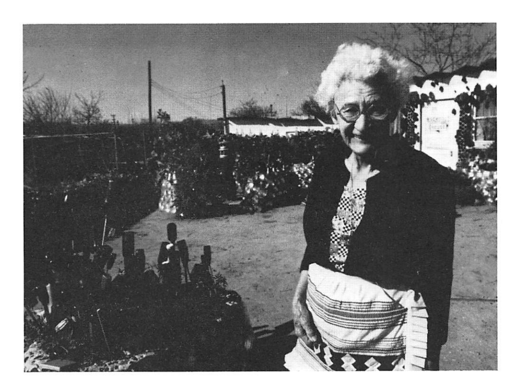
MICHELLE VIGNES "Grandma Prisbrey in her Bottle Village," 1977 Cibachrome print

THE CHEVRON GALLERY, 555 MARKET STREET, SAN FRANCISCO, APRIL 9 THROUGH MAY 25, 1984