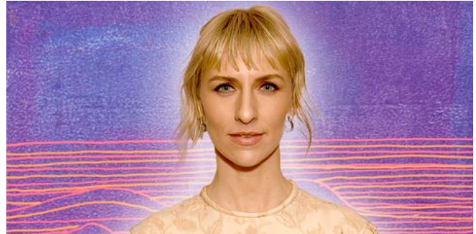
What Mickey Sumner Knows About Being a Boss