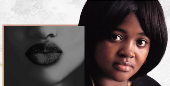
Sister Souljah on Her New Book, 'Life After Death'